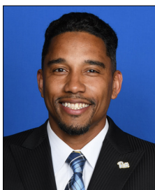
Archie Collins Secondary